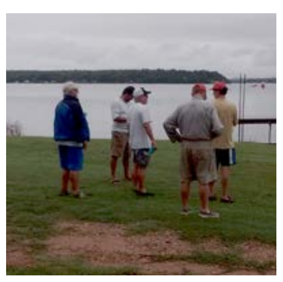
Jealous spectators watch the Culver 100 during a brief break in the rain.