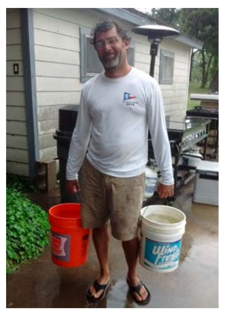
Everyone knows Race Committee Chairman's duties include hauling water for toilet flushing when the power goes out.