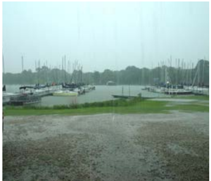
Still more rain falls on LWSC. Check your boats, drain standing water before the mosquitos find it.